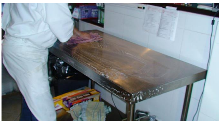
Figure 1. Benchtop cleaning.

Cleaning and sanitising can be done mechanically using dishwashers or manually using wash up sinks and spray bottles.