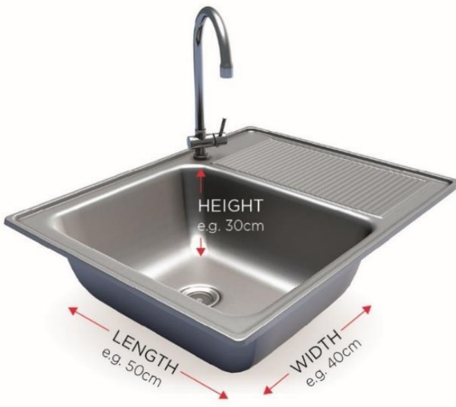
Figure 4. Measuring the sink to calculate volume.

Example: a rectangular sink 40 cm wide, 50 cm long and filled to a height of 30 cm.