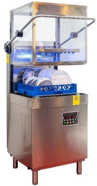
Figure 2. Commercial dishwasher.